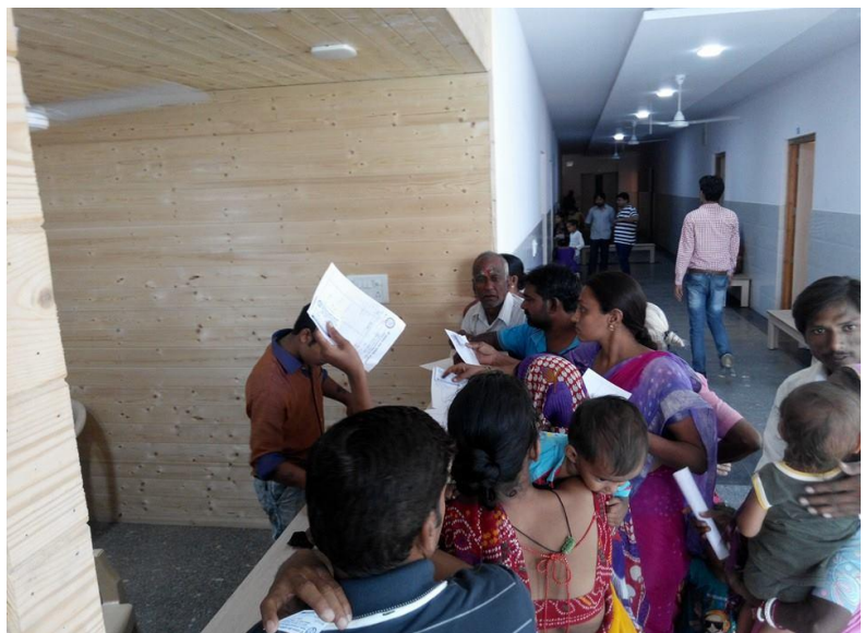
Free Blood Transfusion for Thalessemia patients

Free Blood Transfusion Center is run at Deep Children Hospital and Research Center with support of Child Health Foundation. About 7 patients are registered till date. Around 64 blood transfusions were done free of cost last year.