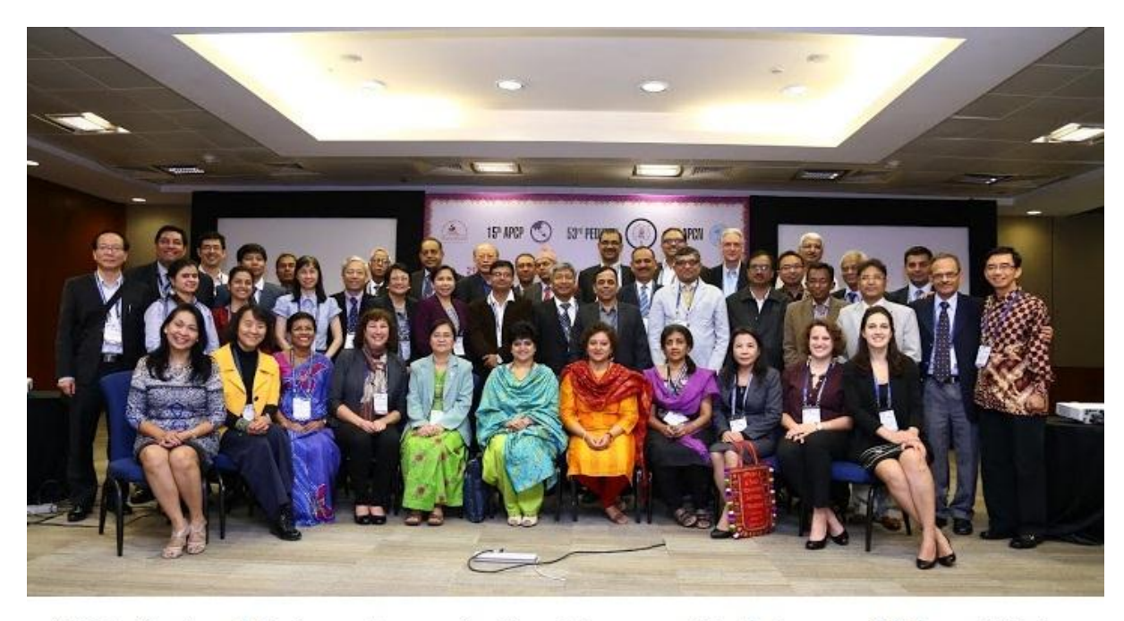
APPA, Gavi and Partners Immunization Advocacy Workshop on 20th and 21st January, 2016 at Hyderabad, Telangana